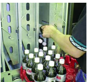
Easy Loading Product Stacks