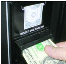
MDB Compatible Dollar Bill Acceptor