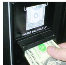
MDB Compatible Dollar Bill Acceptor