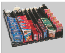
Flexible Trays Make Reconfiguration Easy.