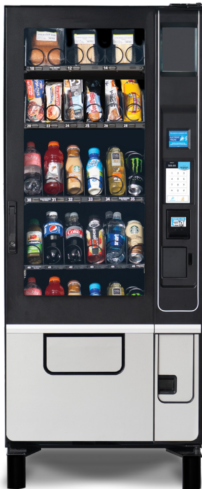
Shown with 7" Touch Screen Upgrade